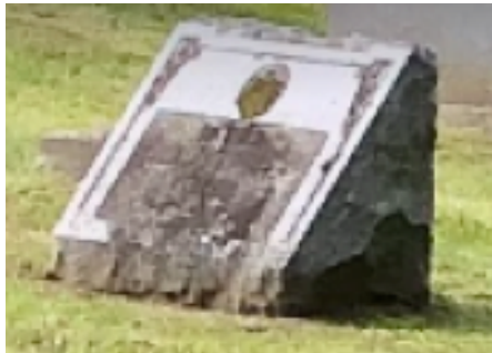
"Family, HELP! I really need some cleaning!"