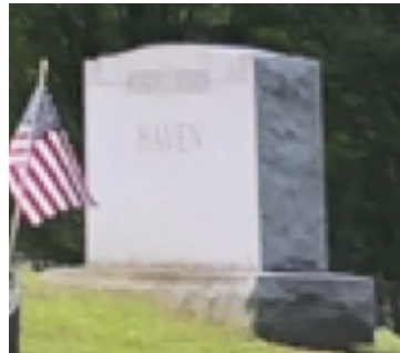
"Thank you, famliy, for cleaning me! I really shine!"